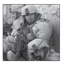
U.S. Soldiers in Iraq

To be sure, any adequate response to the terrorist threat demands a mixture of civic and martial fortitude and political dexterity that goes far beyond the anemic police measures favored by quasi-pacifistic Europeans today. But inexact talk about an open-ended "war on terror"—which in truth implies war without end—does not adequately convey the unsettling gray zone between war and peace that will characterize the international situation for the fore-